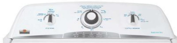
MED10ZEMW controls with English and Arabic