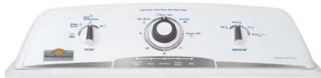
MED10ZEMW controls with English only